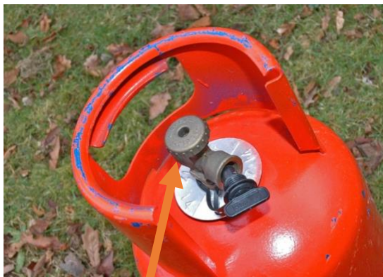
Gas On/off valve -

Please note, the indicator stalk should not be moved/adjusted. This is done by the park when they replace your bottle