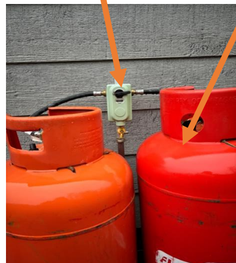
Indicator stalk - currently pointing at the right bottle